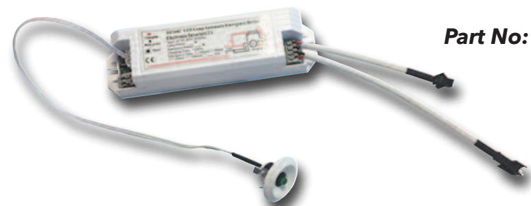
Part No: LEDLEP