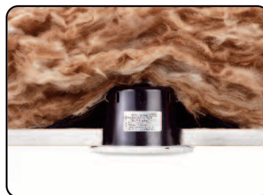
Insulation can be placed directly over the fitting

VELA Compact downlights have been independently tested to the British Standard 60598-1 Clause 12.4 by the Lighting Industry Association. Contact us for copies of the full test report.